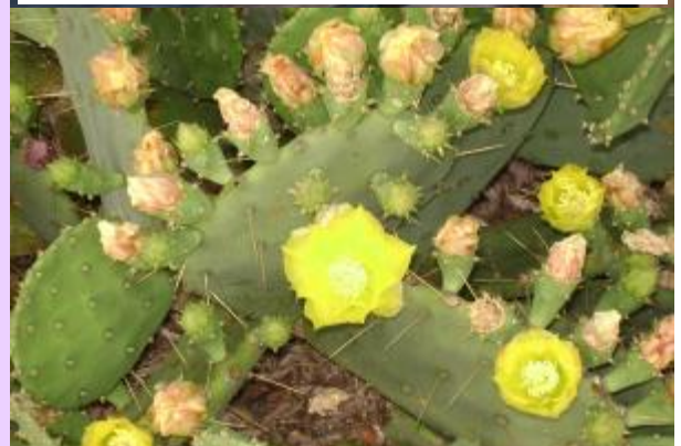
The cactus are in full bloom.

For the invisible things of Him from the creation of the world are clearly seen, being understood by the things that are made, even His eternal power and Godhead; so that they are without excuse...Romans 1:20