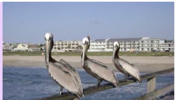
Our three feathered friends (pelicans) posed nicely for this shot!

The bloom stalk grew at an incredibly fast rate. Notice the deck on the right side of each picture and how the plant looms way above it in the picture on the left.