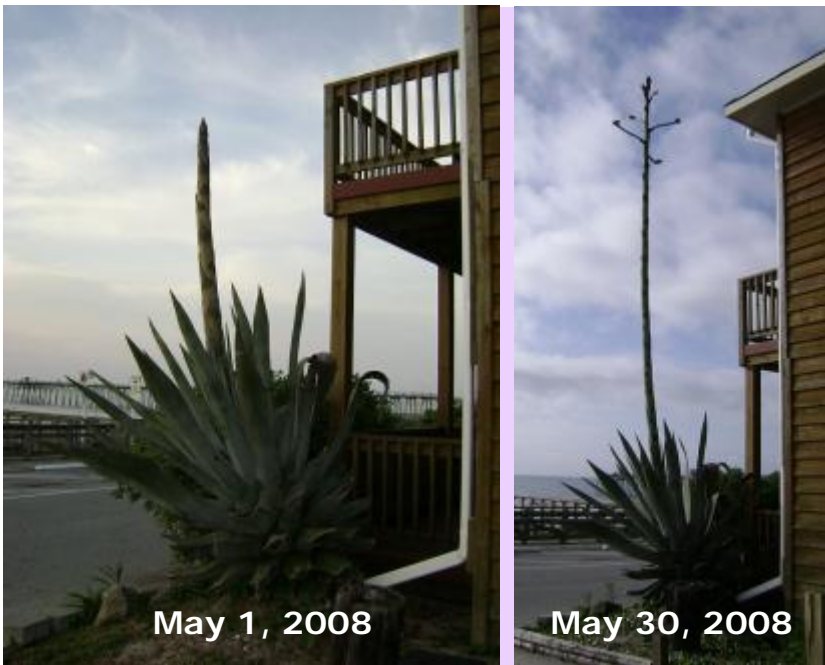
Kure Beach Century Plant Located on the Ocean Front at the Seven Seas Motel

Welcome to the Family of God! Contact us if you'd like to talk with someone about your decision at (910) 470-1291 or email at derwin@derwinhinson.com