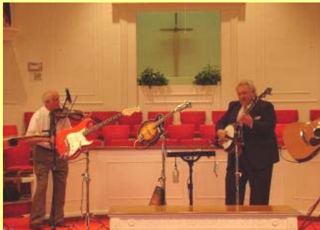
Playing Together Five Years Later in 2008

Christian man. Sometimes our "heroes" are not very nice. It's disappointing to get to know someone and find out that they are not who they appear to be on stage. It can be a letdown, but the lesson we can learn from this comes straight from the center of the Bible. Psalm 118:8 says, "It is better to trust in the LORD than to put confidence in man." Unlike people, Jesus will never fail you.